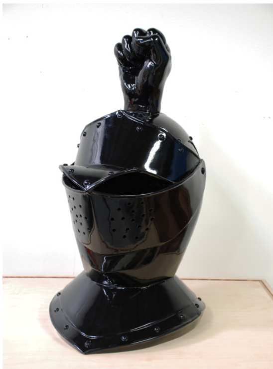
Ian Weaver Black Knight Gauntlets , 2010 Aluminum with Gold Leaf 6" x 6 ½" x 12" (approx.) Edition of 5